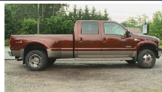
This truck was featured in the ABC News story investigating the fraudulent sale of a Hurricane Sandy flood loss vehicle.